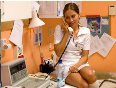
Hospital at the End of the City – The New Generation Nemocnice na kraji města – Nové osudy

co-production: Media Consulting Rights Available: TV Video