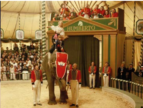
Circus Humberto Cirkus Humberto

co-production: Westdeutscher Rundfunk Köln A/R Rights Available: for part of the territories only