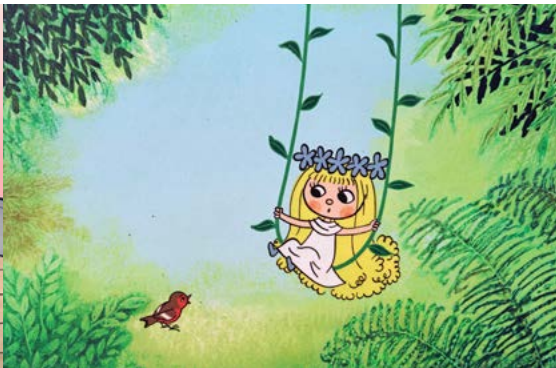
Stories of Amelia the Forest Sprite Říkáni o víle Amálce

In the colour cartoon series, children experience many exciting adventures with Amelia, the clever little forest sprite, who protects her forest friends from people intent on disturbing their peace.