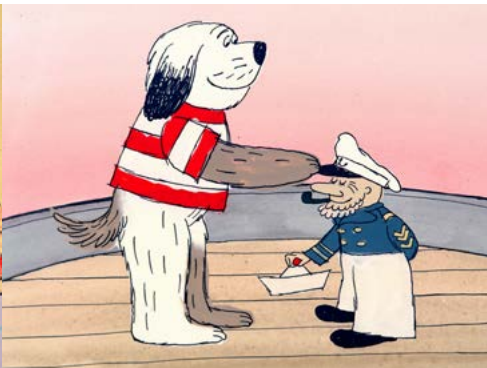
Maxidog Fík Maxipes Fík

Like every dog, Fík was a sweet little puppy at first. But he grows so fast and to such a size that he becomes the terror of the neighborhood. Inside, however, he is truly kind and clever. His adventures start at home with his family, then continue at school where he is an exemplary pupil, and afterward out in the wide world. He sails the seas, flies a plane, visits Africa and the Polar Circle and returns home an experienced traveler.