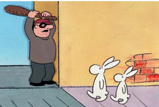
Bob and Bobby – Top Hat Rabbits Bob a Bobek – králíci z klobouku

A cartoon series starring two rabbits who live in a magician's hat. Bob and Bobby are two fun little characters who think up something new to do every day. Even with the best of intentions sometimes things go wrong, but their jolly adventures usually have a practical message: exercising is healthy, work can be fun, and sharing is a great way to be a good friend. Bob and Bobby also tell kids to never cheat, be lazy or start fights – and also that it's wise to eat plenty of carrots.