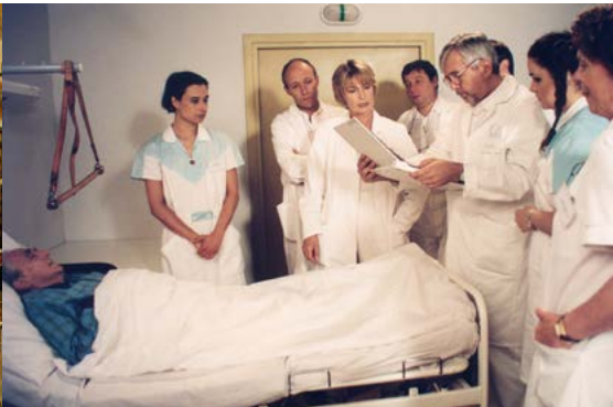
Hospital at the End of the City Nemocnice na kraji města

co-production: SWF Baden Baden, WWF Köln Rights Available: for part of the territories only