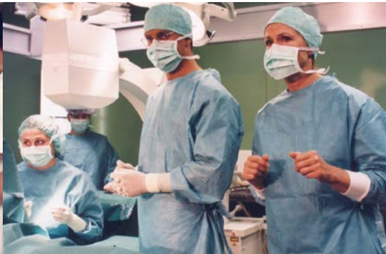
Hospital at the End of the City Twenty Years on Nemocnice na kraji města po dvaceti letech

This serial follows up on the two previous serials about doctors and their patients, produced twenty years ago. The present story is based on the passing of time and the natural aging of the characters, the changed political and social conditions in the Czech Republic.