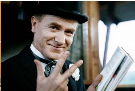
Mister Tau Pan Tau

co-production: Luxor Co.Ltd., Media Consulting Co.Ltd Rights Available: TV Video